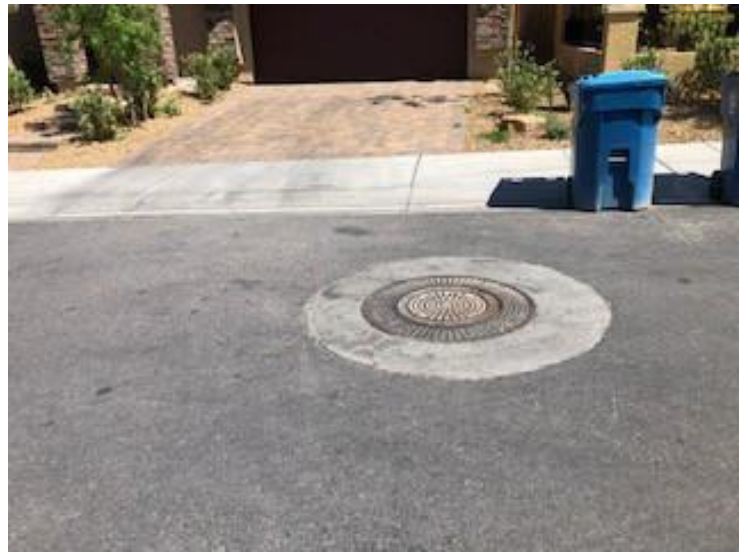
Street Pictures Part 3