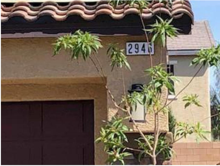
Picture To Show Address

ARC Photos are required for pool/spa/front yard changes or requested by the Board and ARC Refundable Deposit is needed. The Before and After Photos must be taken from the exact same location and the photos must be Date Stamped.