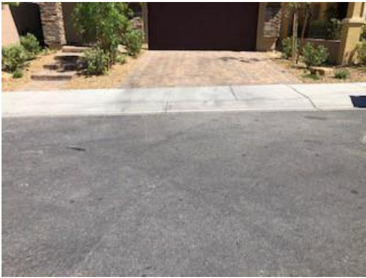
Street Pictures Part 2