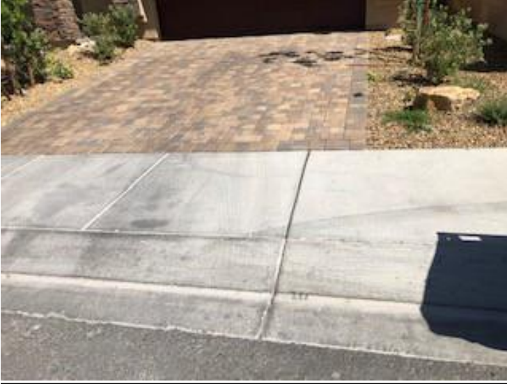
Driveway Approach Picture Part 1