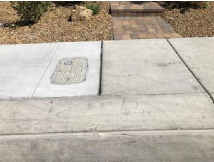
Utility Collar, Sidewalk, Curb and Gutter Pictures Part 1