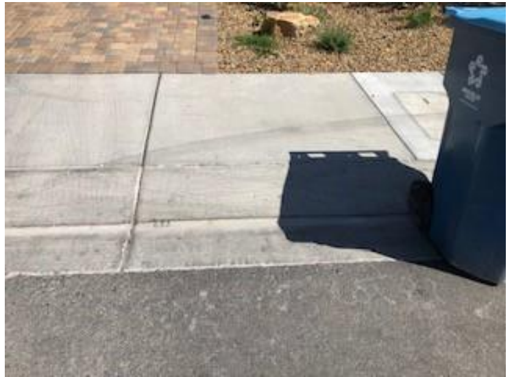
Utility Collar, Sidewalk, Curb and Gutter Pictures Part 4