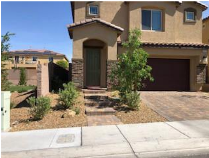
Property Line To Property Line Picture Part1