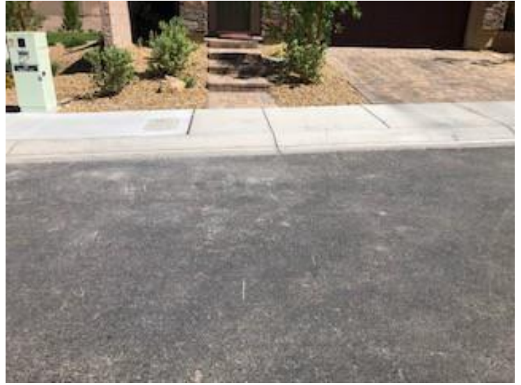
Street Pictures Part 1