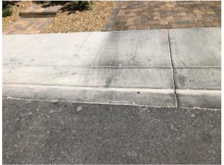
Utility Collar, Sidewalk, Curb and Gutter Pictures Part 2