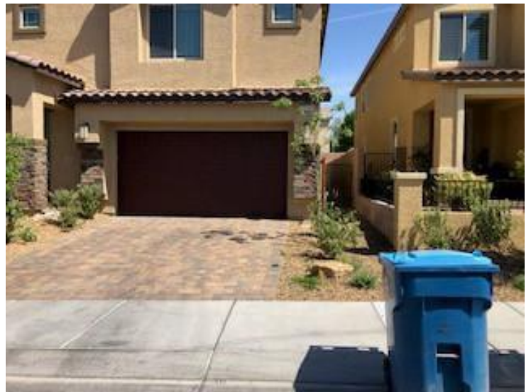
Property Line To Property Line Picture Part 2