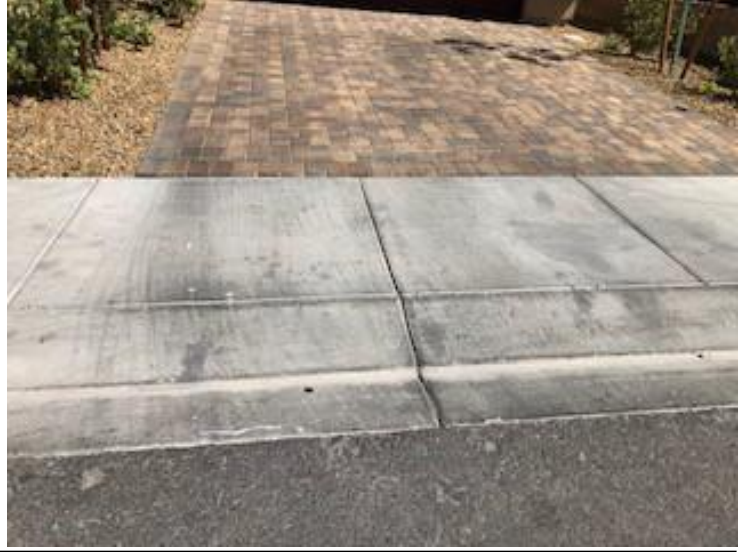
Driveway Approach Picture Part 2