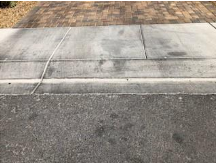
Utility Collar, Sidewalk, Curb and Gutter Pictures Part 3